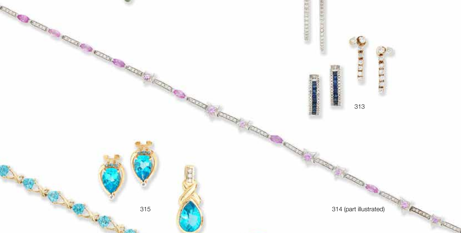
314 (part illustrated)